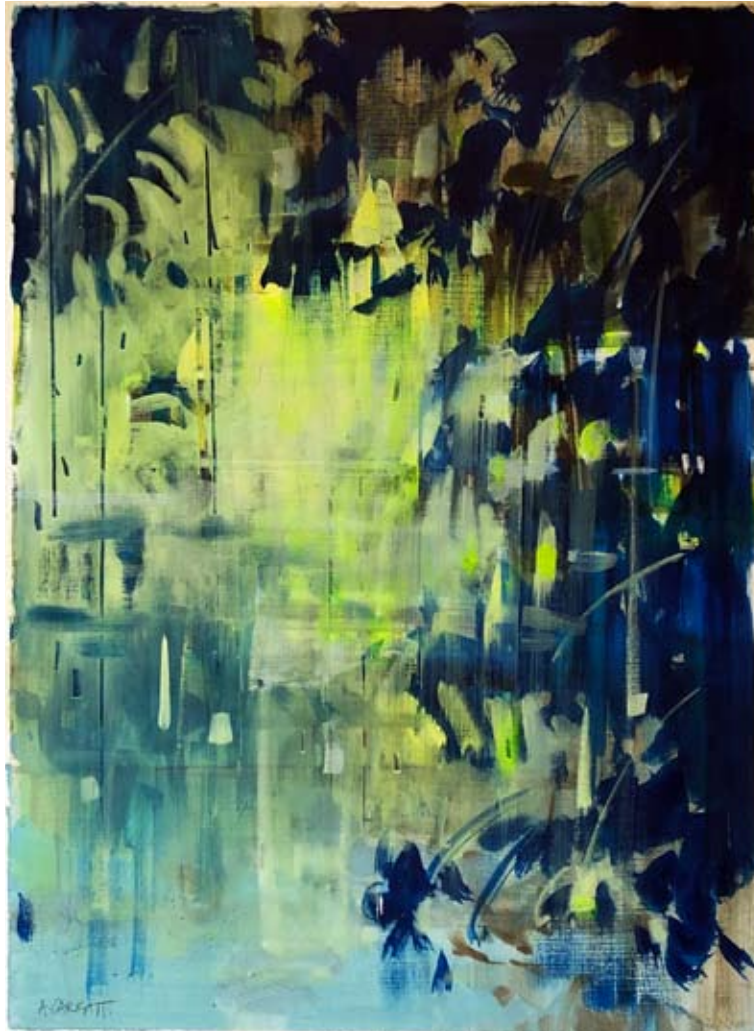
TROPICAL RIVERBANK / 40 X 55CM / 55 X 75CM FRAMED / OIL ON PAPER / £850