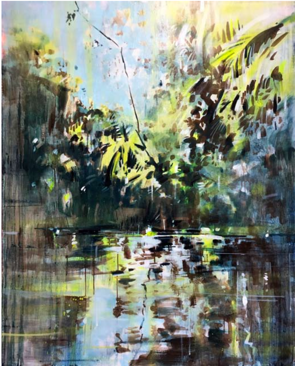
MANGROVE / 120 X 150CM / OIL ON CANVAS / £8,200