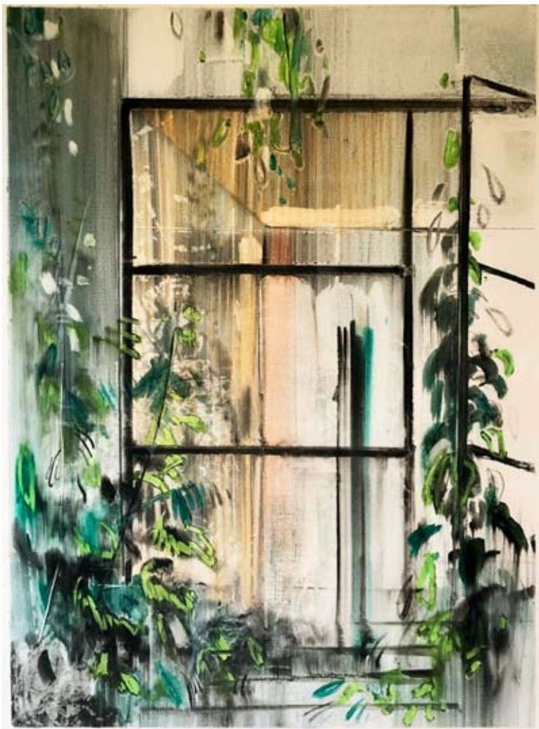
GLASSHOUSE / 40 X 55CM / 55 X 75CM FRAMED / OIL ON PAPER / £850