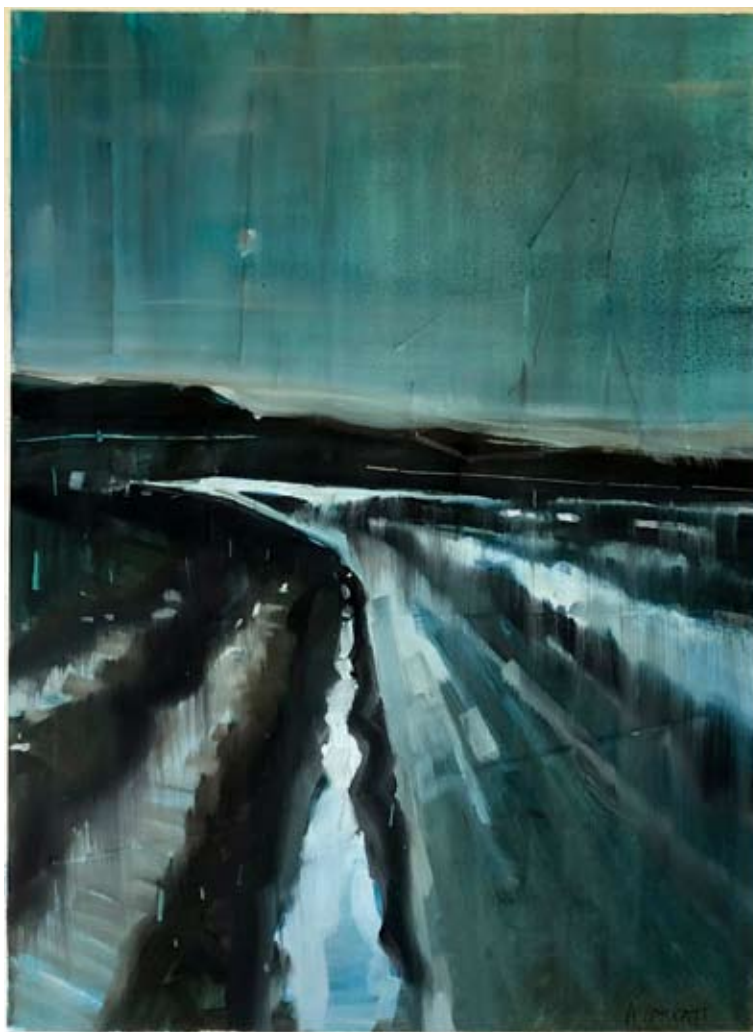
TRACK AND MOON / 40 X 55CM / 55 X 75CM FRAMED / OIL ON PAPER / £850