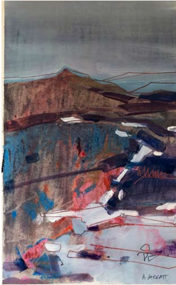
BRACKEN / 25 X 35CM / 35 X 55CM FRAMED / OIL ON PAPER / £350