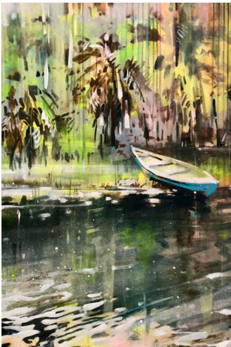
SLOTH / 50 X 75CM / OIL ON LINEN / £1,600