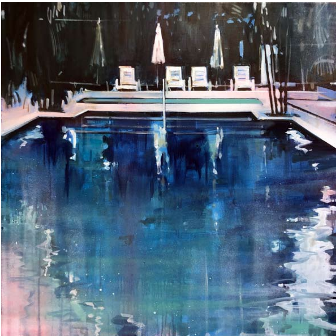
IGUANA / 100 X 100CM / OIL ON CANVAS / £5950