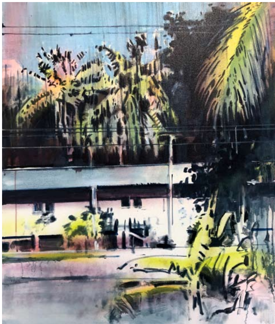
BANANAS AND PYLONS / 75 X 90CM / OIL ON LINEN / £2,850