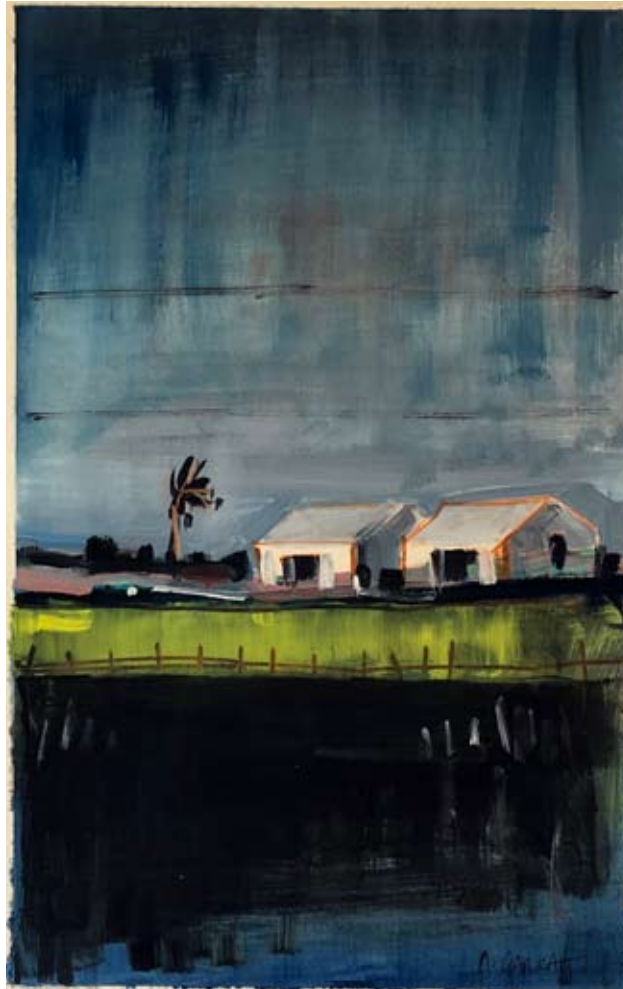
PALM AND BARNS / 25 X 35CM / 35 X 55CM FRAMED / OIL ON PAPER / £380