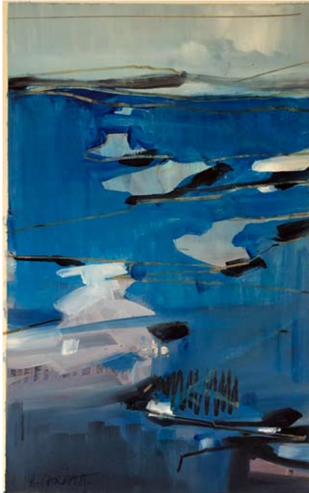
ICE AND PUDDLE / 25 X 35CM / 35 X 55CM FRAMED / OIL ON PAPER / £380