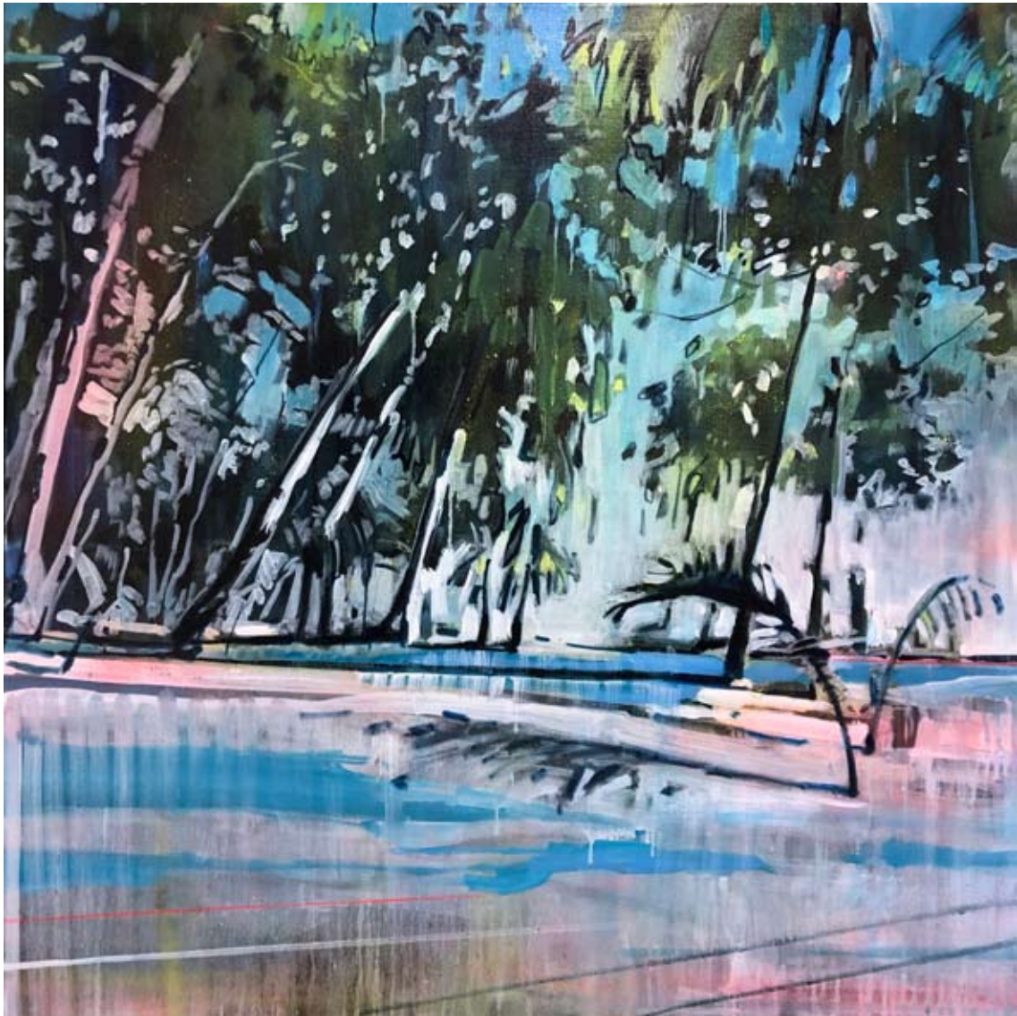
BEJUCO BEACH / 100 X 100CM / OIL ON CANVAS / £5800