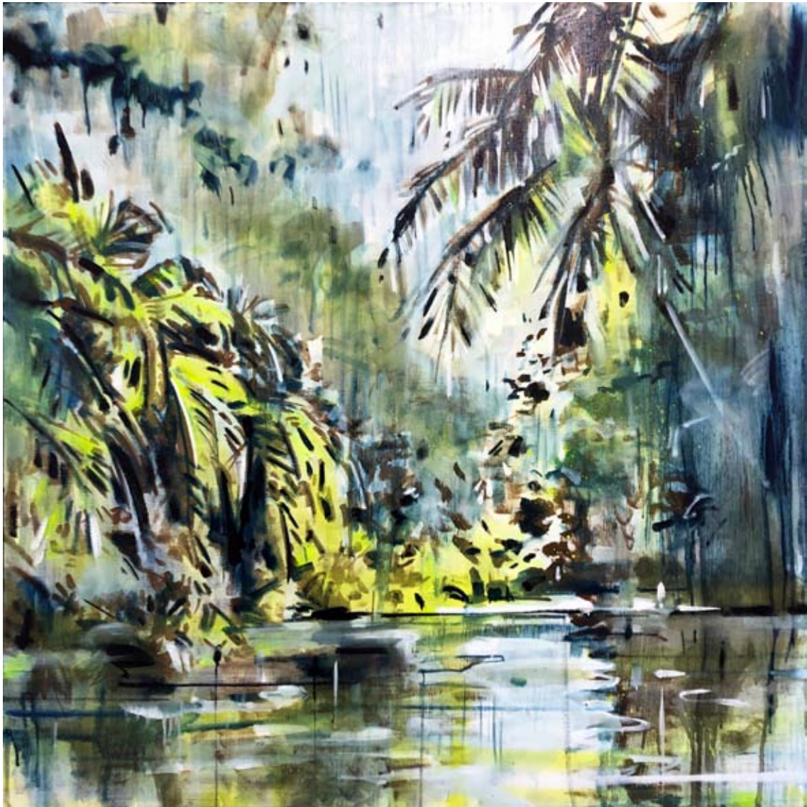
CAPUCHIN / 100 X 100CM / OIL ON CANVAS / £5950