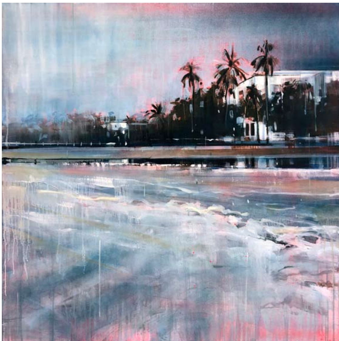
PACIFICA / 100 X 100CM / OIL ON CANVAS / £5950