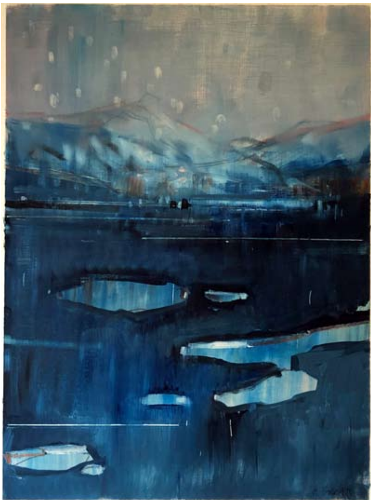
PUDDLE / 40 X 55CM / 55 X 75CM FRAMED / OIL ON PAPER / £850