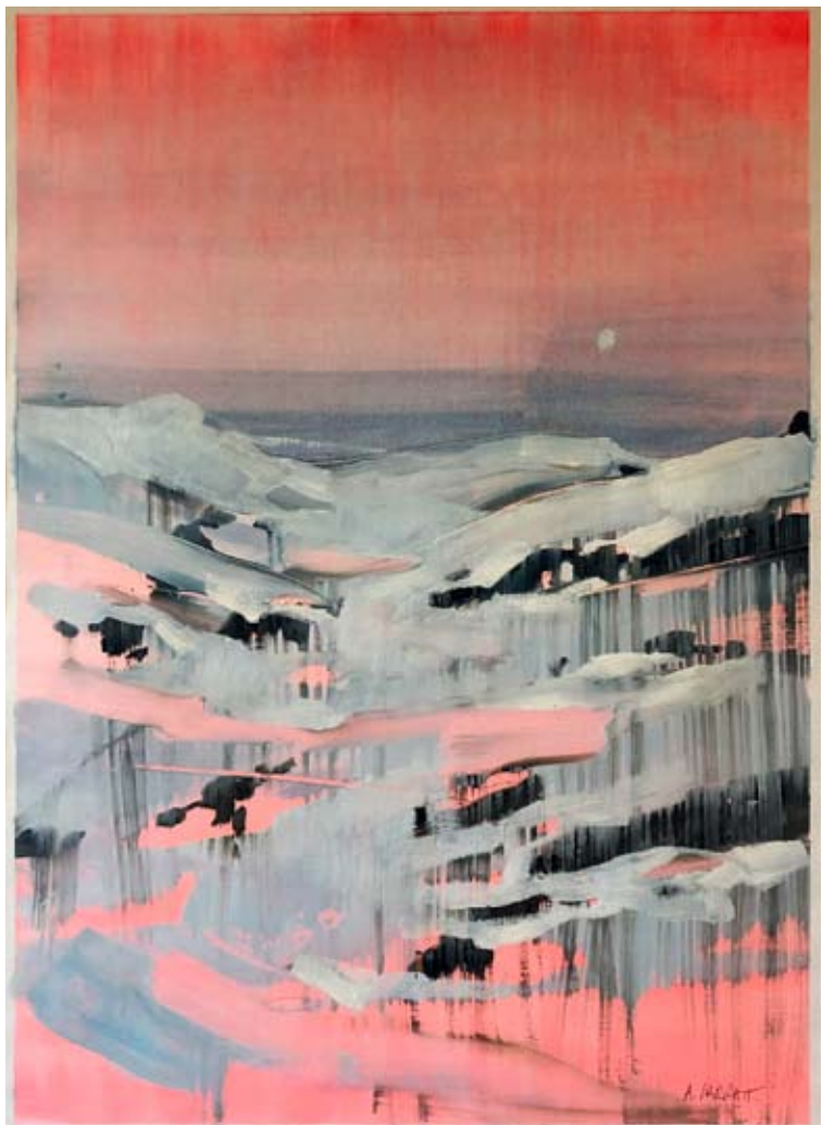
DRIFTS AND MOON / 40 X 55CM / 55 X 75CM FRAMED / OIL ON PAPER / £850