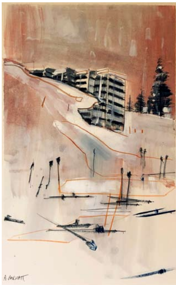
RACLETTE / 25 X 35CM / 35 X 55CM FRAMED / OIL ON PAPER / £380