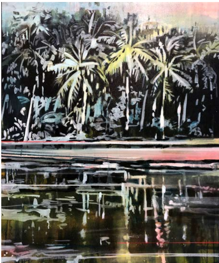
CAHUITA / 75 X 90CM / OIL ON LINEN / £2,600