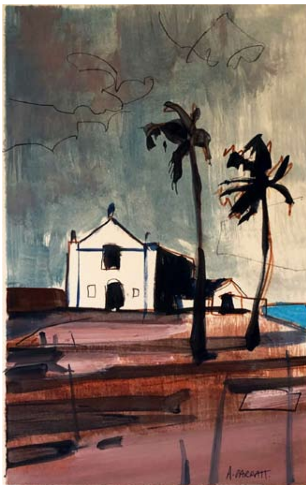
REFUGE / 25 X 35CM / 35 X 55CM FRAMED / OIL ON PAPER / £380