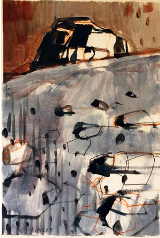
GRANITE / 25 X 35CM / 35 X 55CM FRAMED / OIL ON PAPER / £380