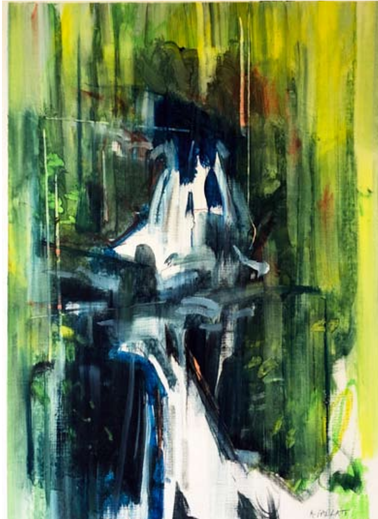
MOSS AND RIVER / 40 X 55CM / 55 X 75CM FRAMED / OIL ON PAPER / £850