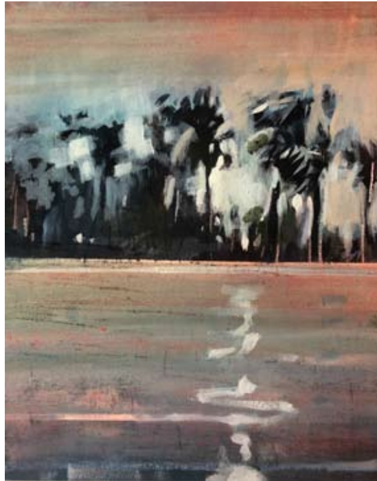
CAHUITA SHORE STUDY / 26 X 30CM / OIL ON CANVAS / £200