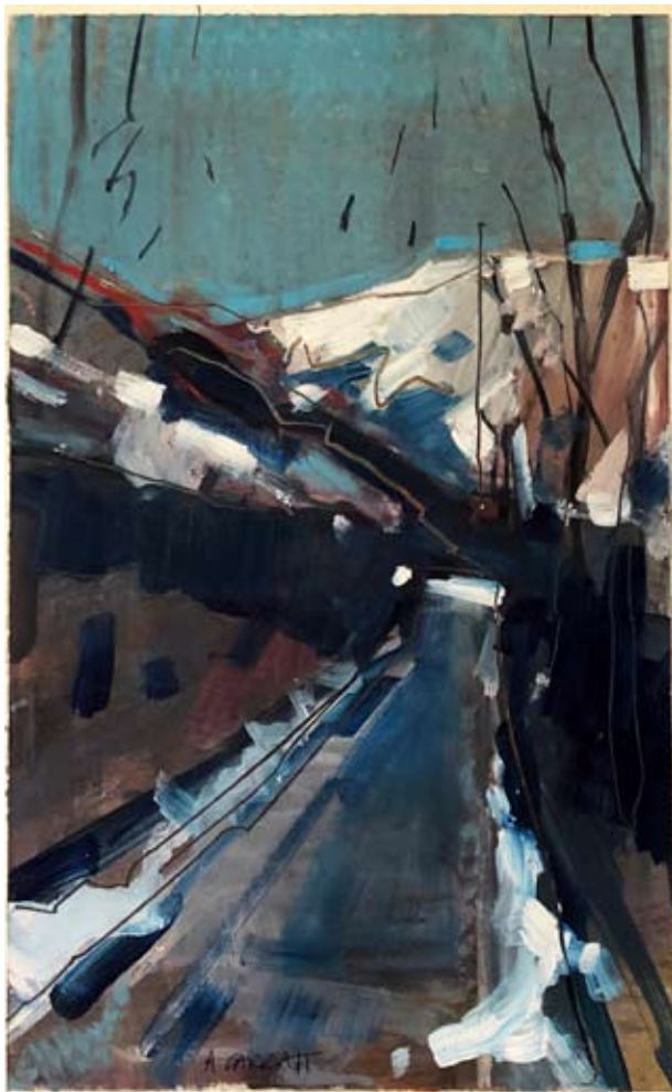
VERGES / 25 X 35CM / 35 X 55CM FRAMED / OIL ON PAPER / £380