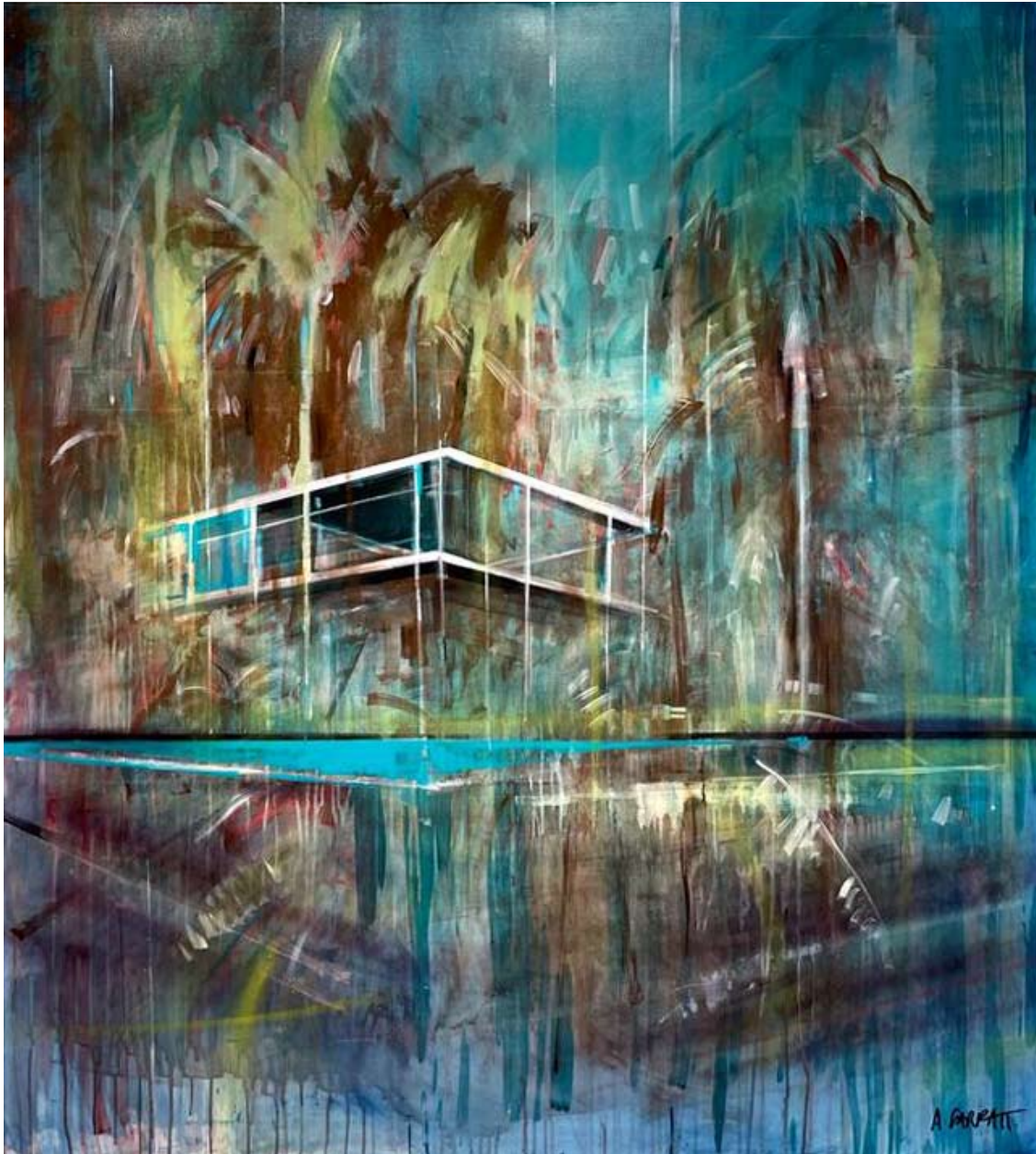
RAIN HAUS / 160 X 180CM / MIXED MEDIA ON CANVAS / £13,000