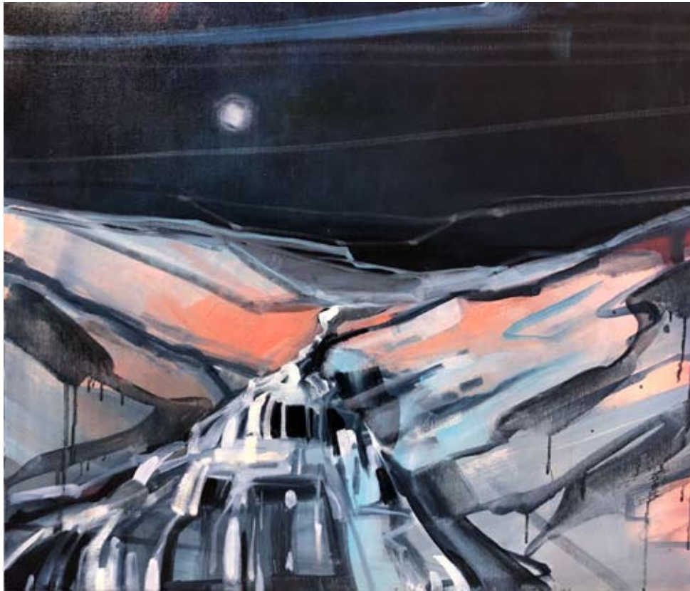
MOON SONG / 70 X 60CM / OIL ON LINEN / £1,400