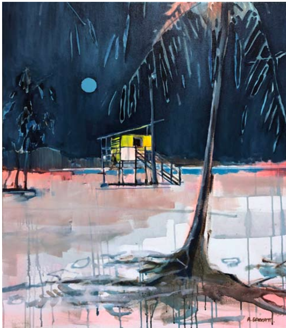
JACO / 75 X 90CM / OIL ON LINEN / £2,700