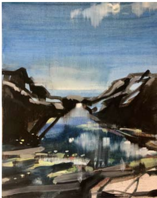
PADDLE STUDY / 26 X 30CM / OIL ON CANVAS / £200