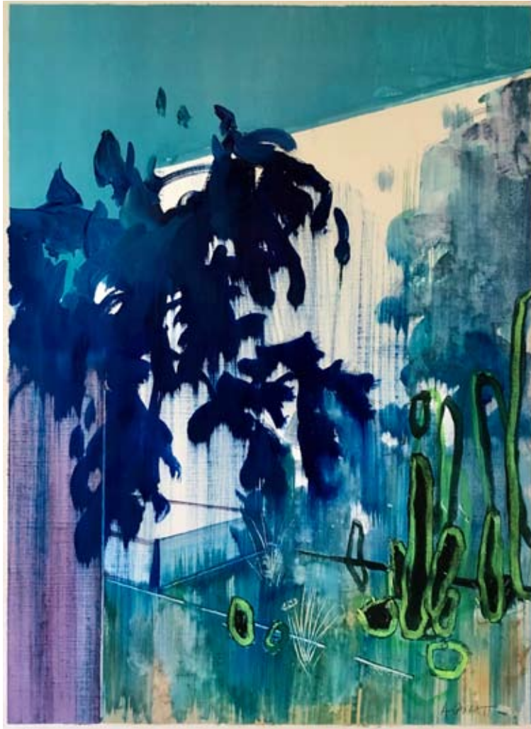
SHOWERS AND SHADOWS / 40 X 55CM / 55 X 75CM FRAMED / OIL ON PAPER / £850