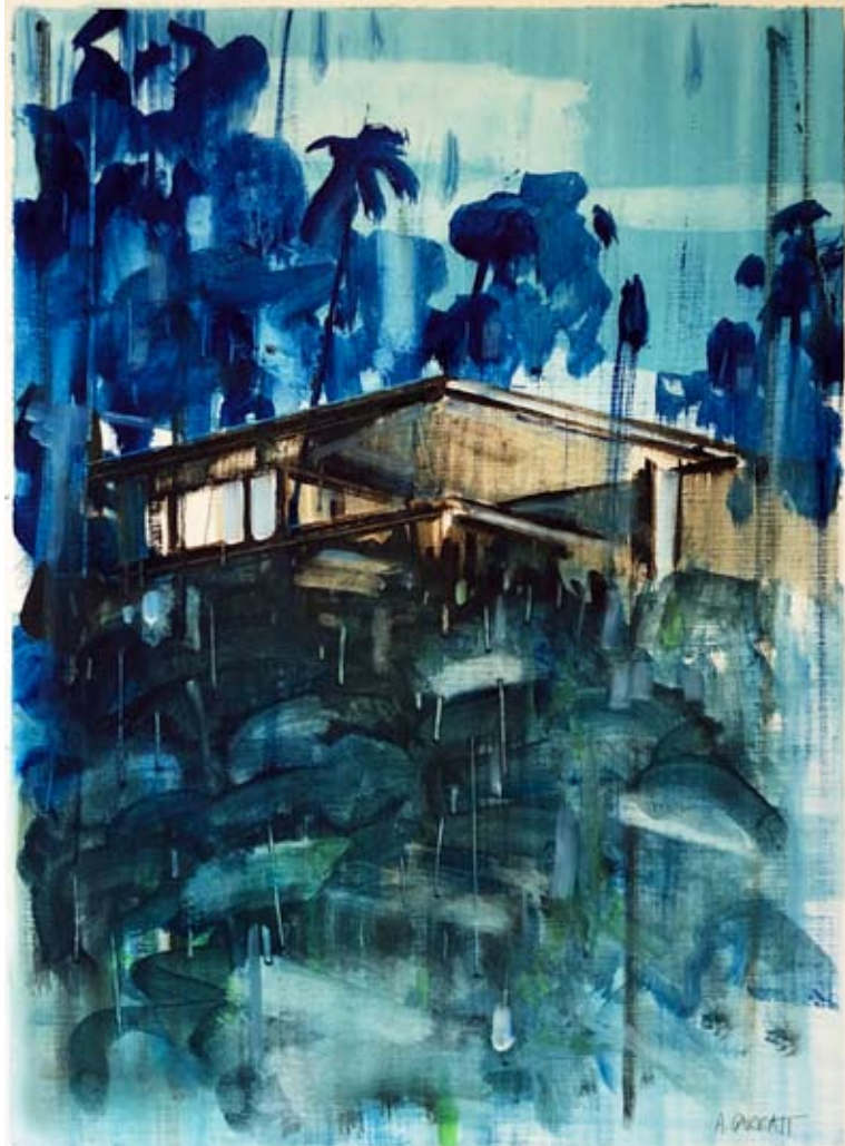
RAIN HAUS STUDY / 40 X 55CM / 55 X 75CM FRAMED / OIL ON PAPER / £850