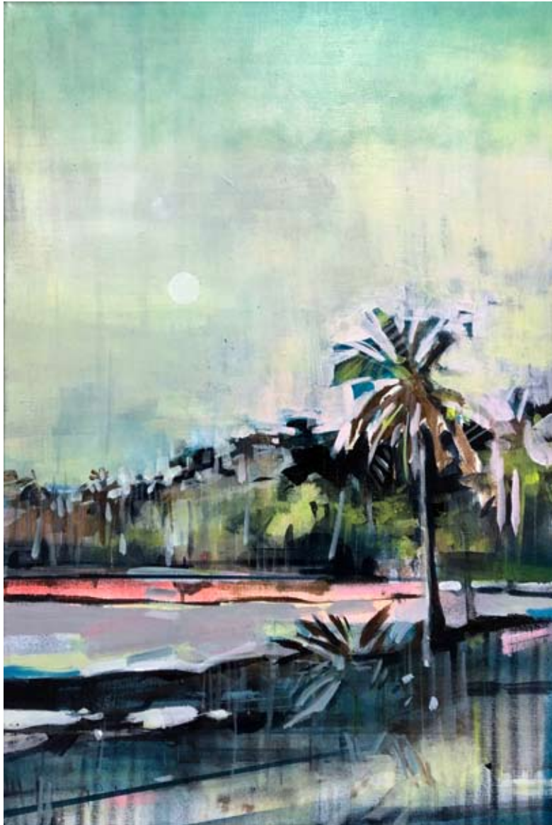
THE RESERVE / 50 X 75CM / OIL ON LINEN / £2,100