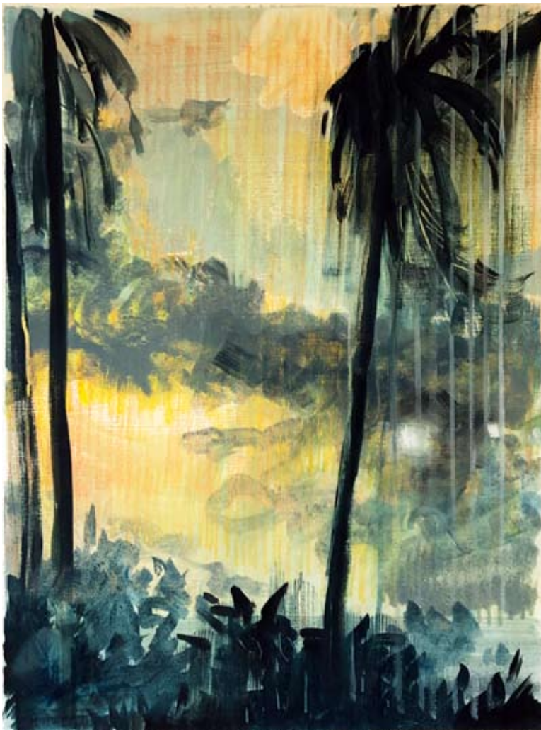
VOYAGER / 40 X 55CM / 55 X 75CM FRAMED / OIL ON PAPER / £850