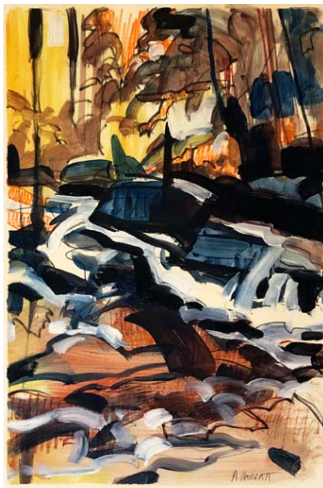
AVON / 25 X 35CM / 35 X 55CM FRAMED / OIL ON PAPER / £380