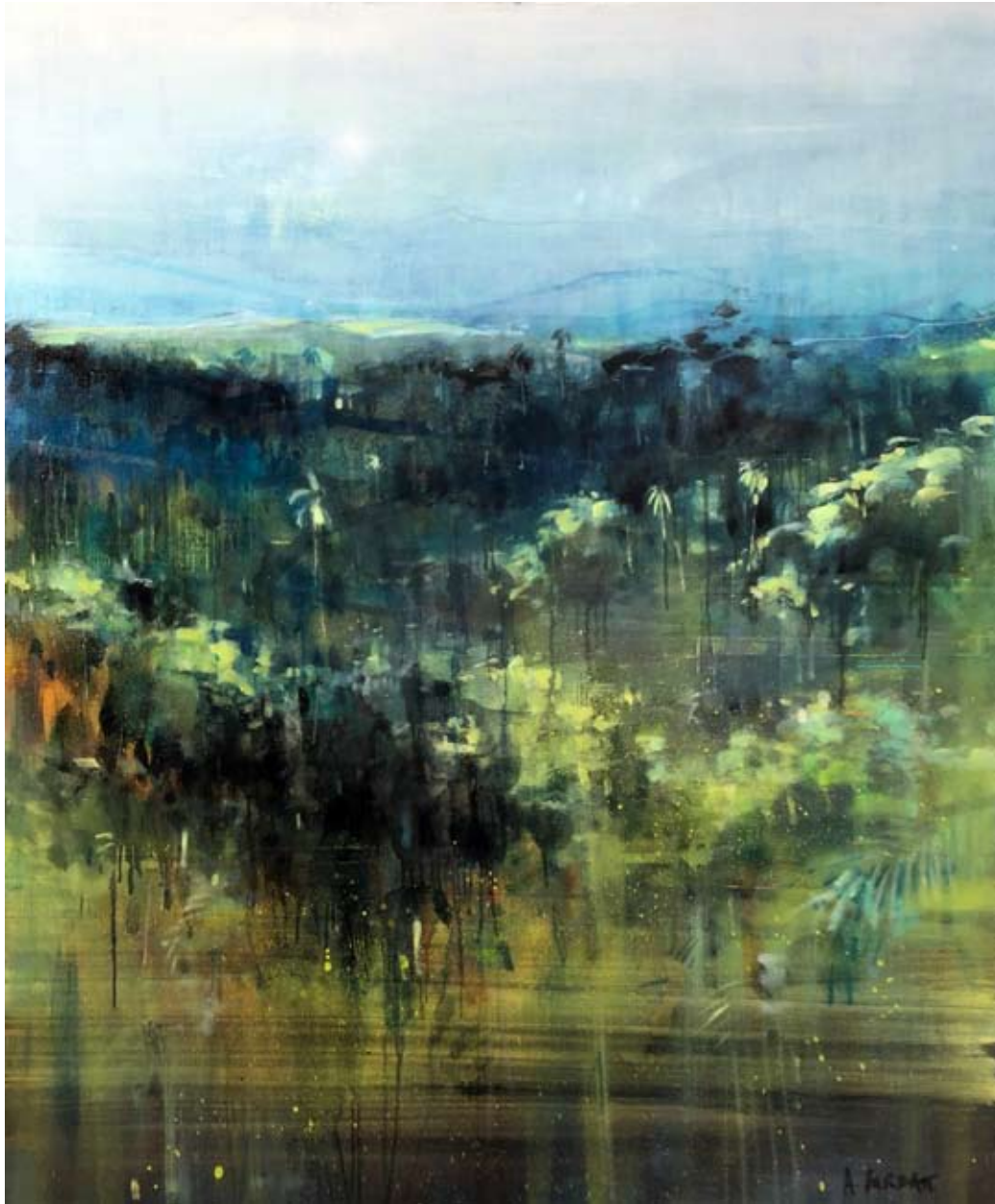
ARENAL / 100 X 120CM / OIL ON CANVAS / £3,950